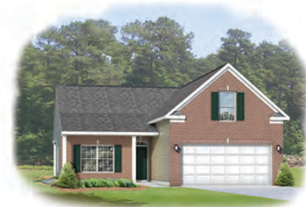
Elevation "B" w/ Optional Bonus Room