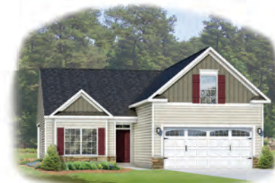
Elevation "D" w/ Optional Bonus Room