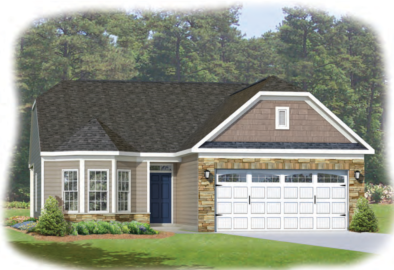
The Cary Elevation "C"