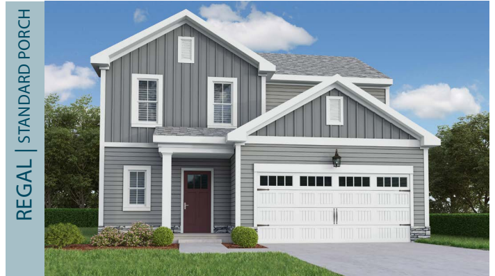
REGAL | STANDARD PORCH