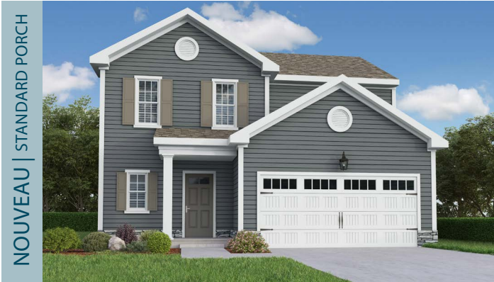
NOUVEAU | STANDARD PORCH

THE AMALFI II is crafted to make the most out of every square foot this beautiful home has to offer. The great room, breakfast area and kitchen are designed to be spacious and efficient. Numerous windows at the side and rear of the home along with sliding porch doors bathe the first floor in natural light. Two spacious secondary bedrooms and a roomy primary suite make this home a great option.