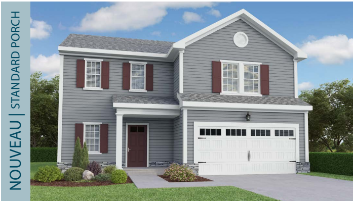
NOUVEAU | STANDARD PORCH

THE MONDOVI II makes an excellent first impression by creating a bright and spacious feel upon entering the home from either the front door or the family entry via the garage. Upstairs, whether utilizing the standard loft or converting it to a fourth bedroom, this home is designed to grow with you over time with its efficient use of living space.