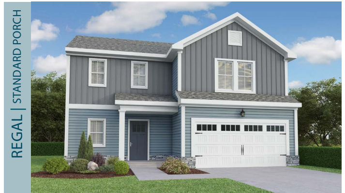
REGAL | STANDARD PORCH